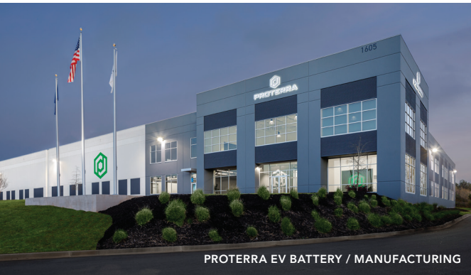
PROTERRA EV BATTERY / MANUFACTURING