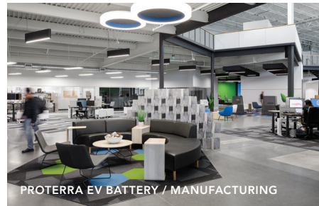
PROTERRA EV BATTERY / MANUFACTURING