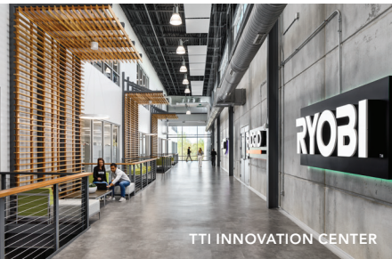
TTI INNOVATION CENTER