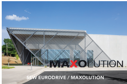
SEW EURODRIVE / MAXOLUTION