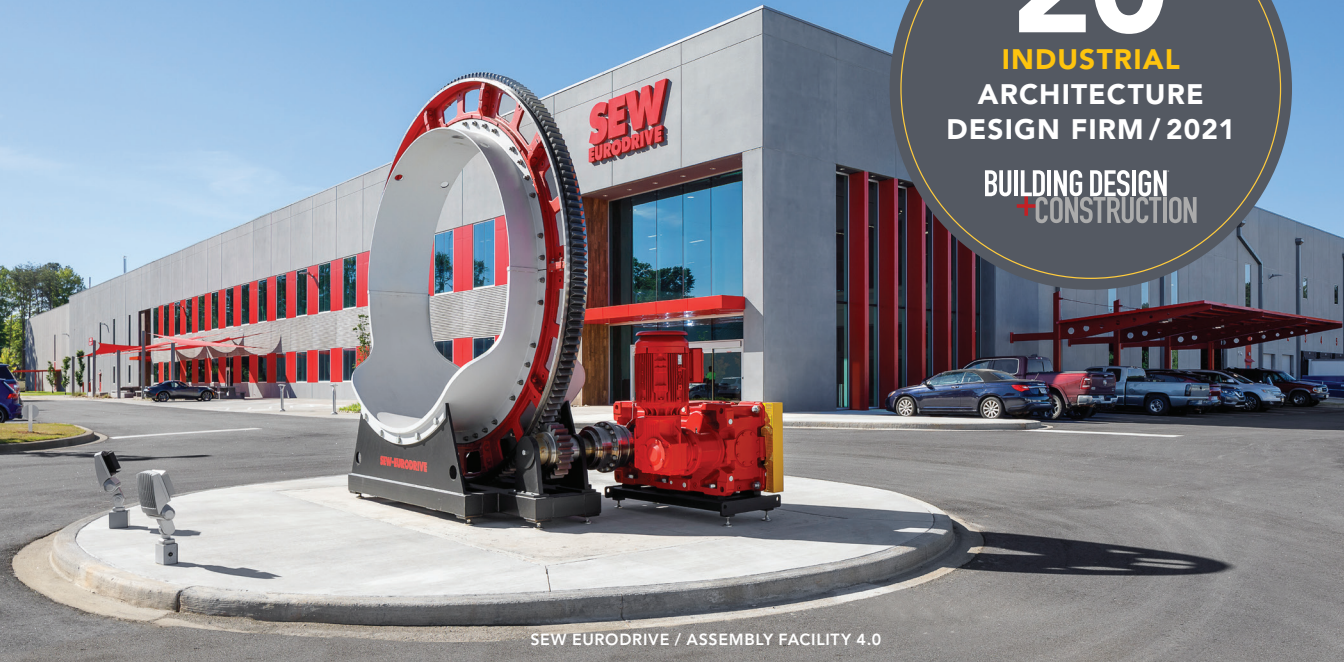
SEW EURODRIVE / ASSEMBLY FACILITY 4.0

NATIONAL TOP 20 INDUSTRIAL ARCHITECTURE DESIGN FIRM / 2021 BUILDING DESIGN CONSTRUCTION